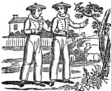
Rambling about the Farm.

rie, where he had seen lions, tigers, a wolf, a spotted panther, a white bear, and other wild beasts.